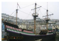
Sir Francis Drake and The Golden Hind