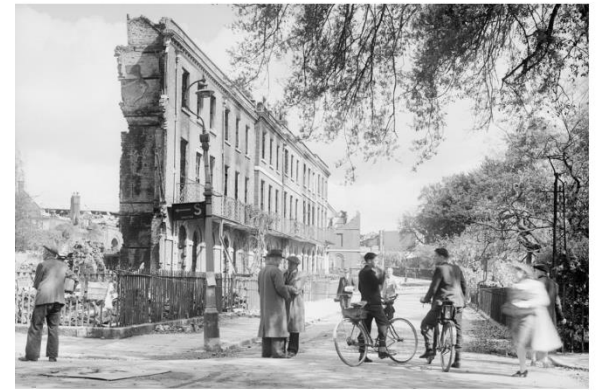
3omb damage in Exeter during the Bitz @ Reproduced by permission of Historic England Archive. Ref. BB42/00714